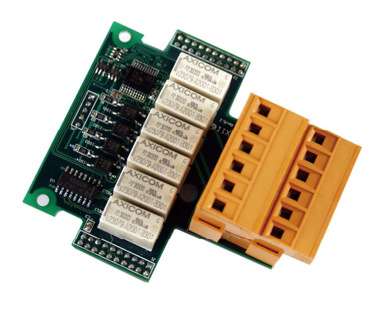
X116 6-channel relay output and 4-channel isolated D/I