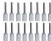
Wire Terminal * 16