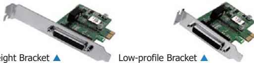
Full-height Bracket ▲

The PCIe-8620 is a low-profile PCI Express board that is suitable for computers with limited space, and is also suitable for standard-size computers since the board is shipped with both full-height and low-profile brackets.